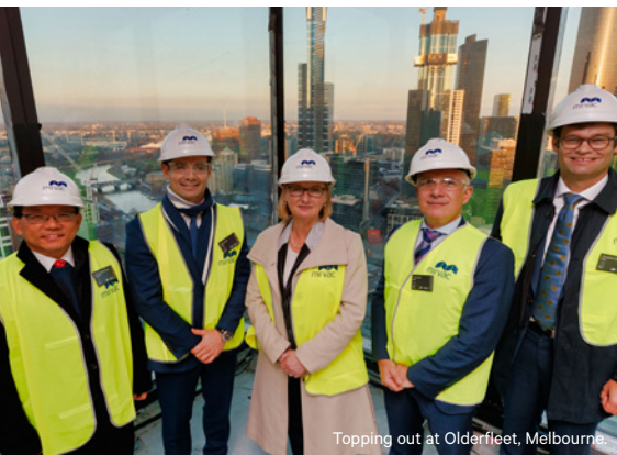
Topping out at Olderfleet, Melbourne