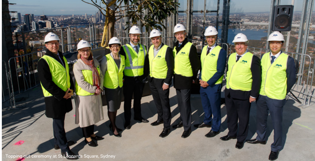
Topping out ceremony at St Leonards Square, Sydney

“As we foreshadowed at our FY19 results, we have passed the bottom of the residential cycle. There are now clear signs of improvement in the Sydney and Melbourne established housing markets with lifts in loan approvals consistent with the upturn in auction market activity, prices and turnover.”