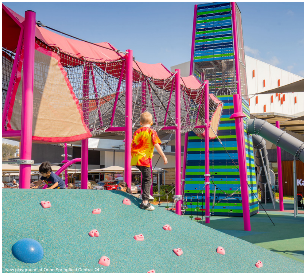
New playground at Orion Springfield Central, QLD

“In 2024, millennials, gen Ys and Zs will overtake baby-boomers and gen Xs in numbers to become the most dominant group in the country. We’re acutely aware of this fast approaching tipping point and are focused on developing a deep understanding of this rapidly expanding cohort, their habits, purchasing decisions and preferences, to ensure we remain ahead of the curve when it comes to reimagining retail for the future.”