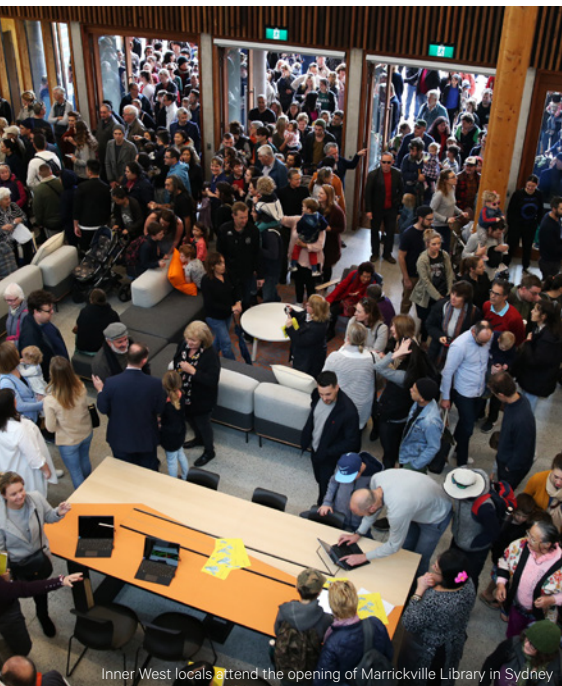
Inner West locals attend the opening of Marrickville Library in Sydney

“As the apartment market continues to face scrutiny, and building standards are called into question, we are actively engaging with Government and other stakeholders to drive change across our industry. Having set the standard in quality for almost 50 years, we are committed to going above and beyond regulatory requirements and paying attention to every detail in order to continue to deliver vibrant new communities that leave a lasting legacy for future generations.”