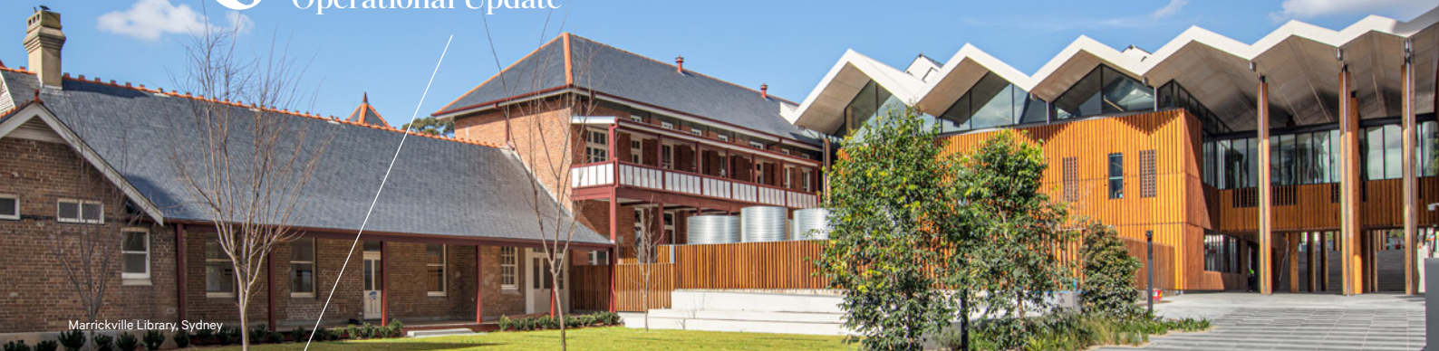
Marrickville Library, Sydney