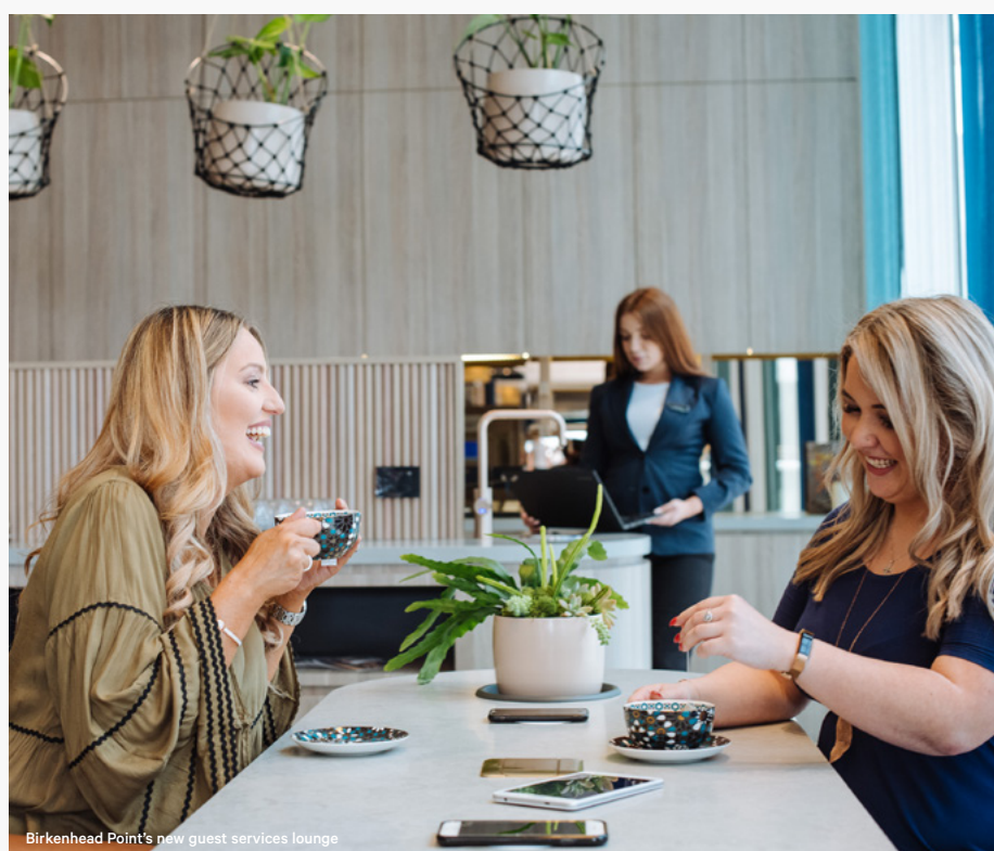
Birkenhead Point's new guest services lounge